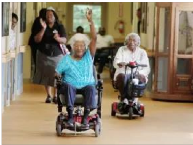
WHEEL CHAIR RACES

Needed to Assist: All Calvary Auxiliaries