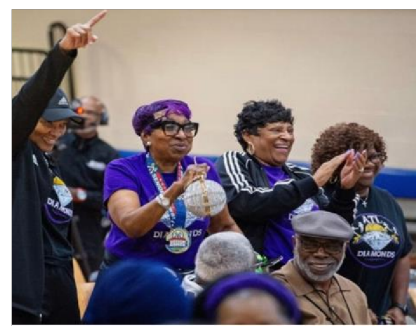
FUN FOR ALL!!!